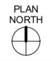
02 - Main Floor Plan 1/4" = 1'-0"