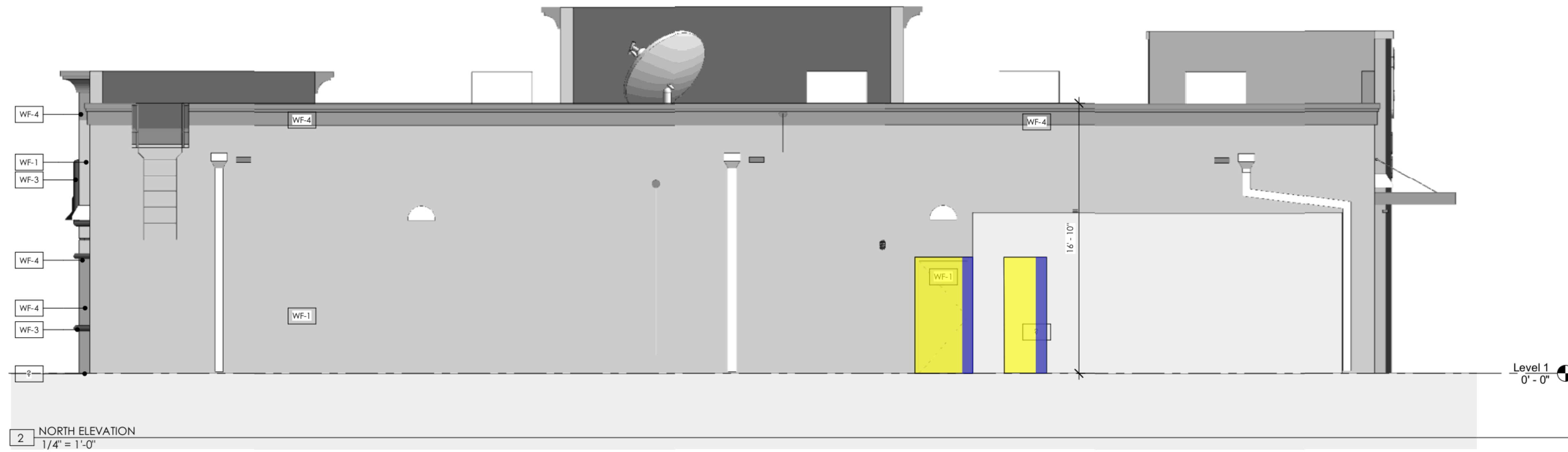
2 NORTH ELEVATION 1/4" = 1'-0"